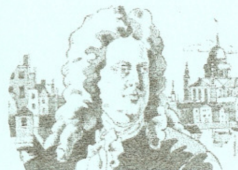
GEORGE FRIDERIC HANDEL